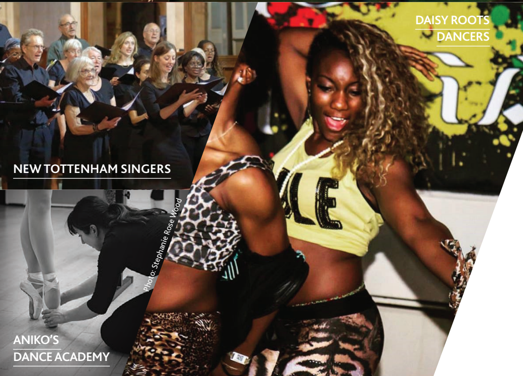
DAISY ROOTS DANCERS