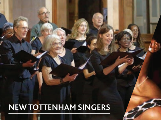
NEW TOTTENHAM SINGERS

New Tottenham Singers rehearse and perform a wide range of vocal music, from Mozart to musical theatre and jazz. Tuesdays 7:30-9:30 pm, £60 per term.