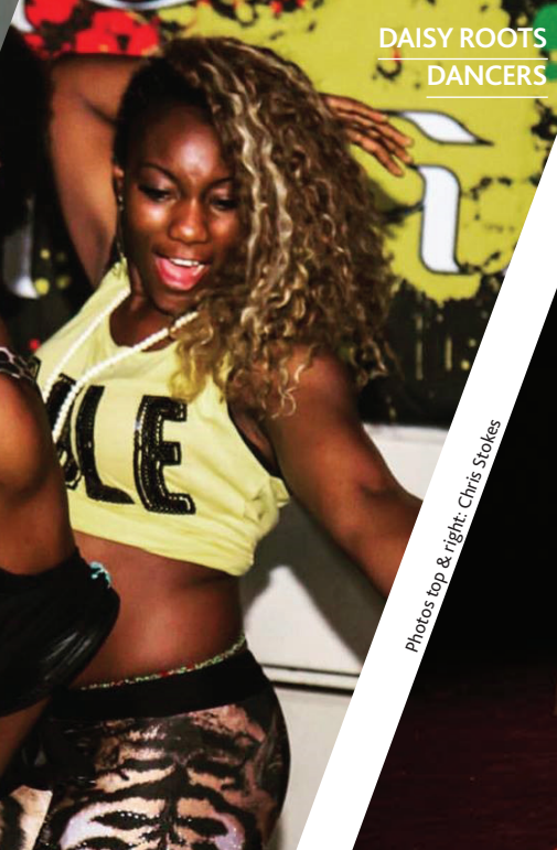
DAISY ROOTS DANCERS